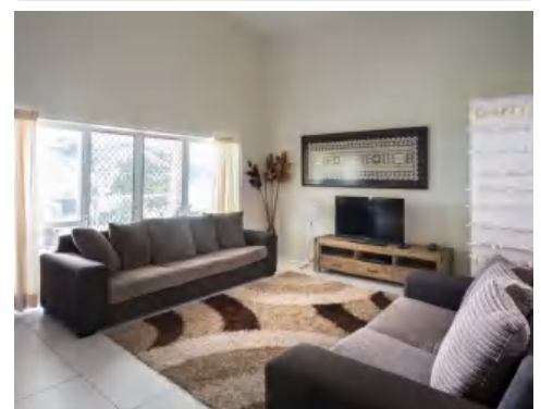
COMFORTABLE LOUNGE AREA