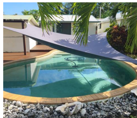
SWIMMING POOL OVERLOOKING THE LAGOON