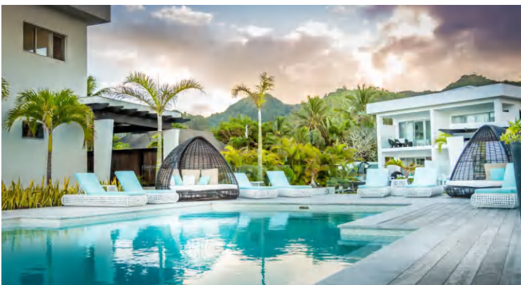
2 BEDROOM LAGOON VIEW VILLAS