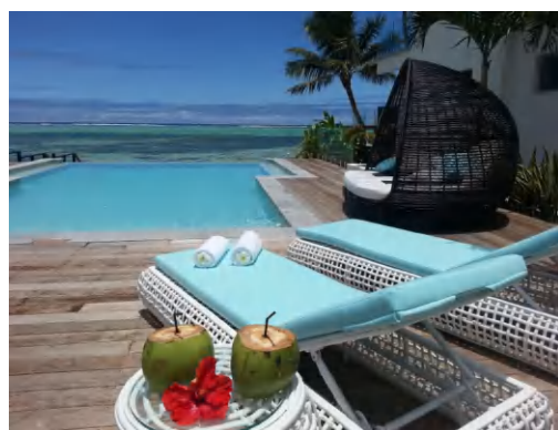
COCONUT DRINKS POOLSIDE