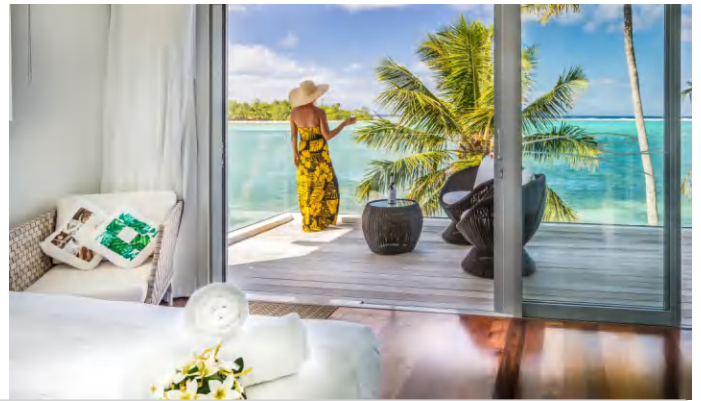
2 BEDROOM BEACHFRONT VILLAS