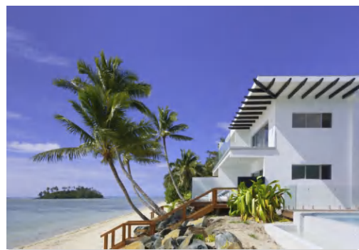
CRYSTAL BLUE LAGOON LUXURY VILLAS

Crystal Blue Luxury Lagoon Villas is the perfect choice for romantic couples looking to celebrate and rekindle their love for one another.