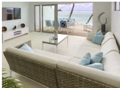
2 BEDROOM BEACHFRONT VILLA