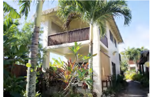
Your Villa awaits you...

The property is centrally located in the village of Arorangi. Restaurants, grocery stores and small retail outlets are all within walking distance of the property.