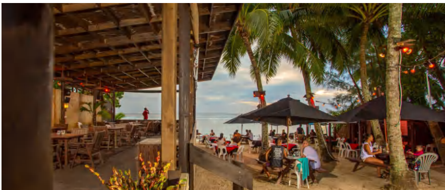
Ultimate Beachfront & Sunset Views