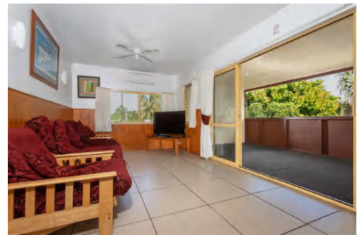
2 Bedroom Deluxe Suite - Lounge