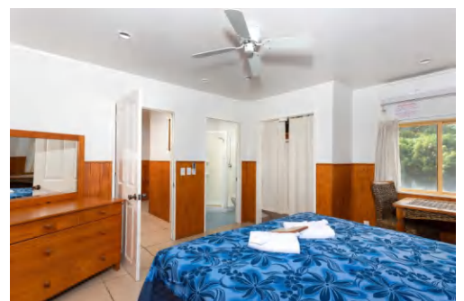
Beautiful island style beddings