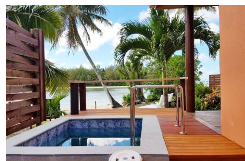
Navigator Studio mini spa pool