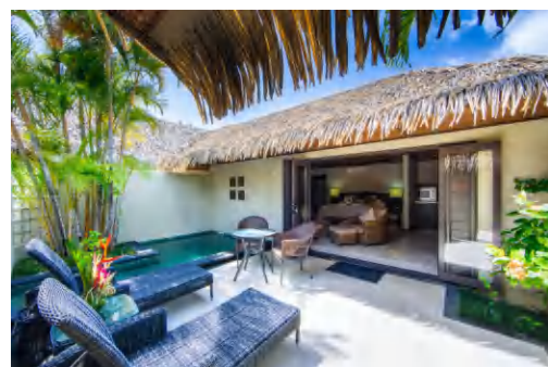
POOL VILLA SUITE