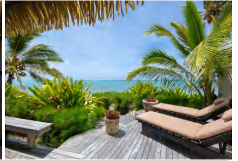
ULTIMATE BEACHFRONT VILLA (1 BEDROOM)