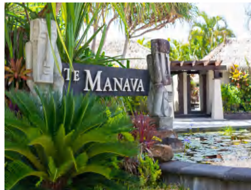
TE MANAVA LUXURY VILLAS & SPA

Te Manava Luxury Villas & Spa has been designed for travellers who appreciate nature's beautiful surroundings, independence and 5 star luxuriously appointed self-contained accommodation.