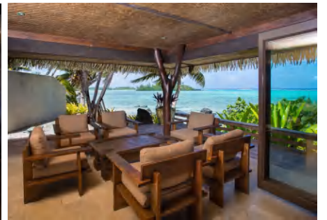
PRESIDENTIAL BEACHFRONT VILLA (3 BEDROOM)