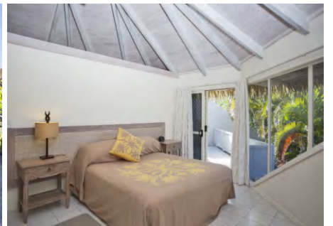
STANDARD POOL VILLA (3 BEDROOM)