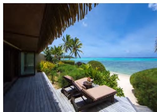
ULTIMATE BEACHFRONT VILLA