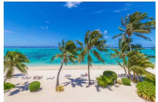
STUNNING BEACH & LAGOON