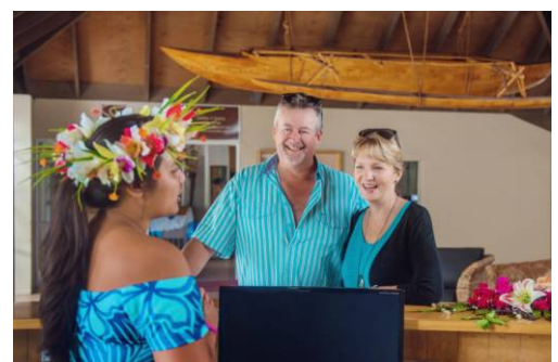
MEET & GREET AT RECEPTION