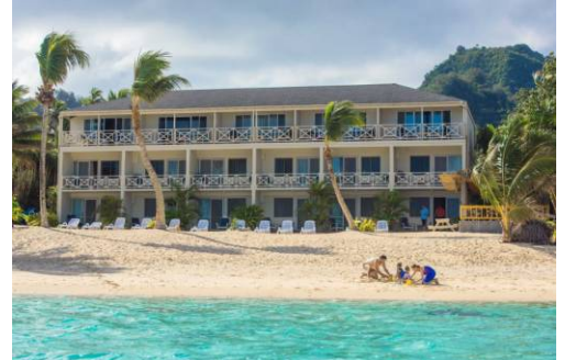
MOANA SANDS BEACHFRONT HOTEL

Complimentary daily tropical breakfast at the onsite restaurant and free use of snorkelling gear & kayaks.