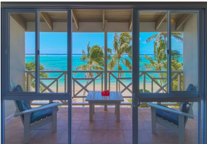
DELUXE BEACHFRONT STUDIO