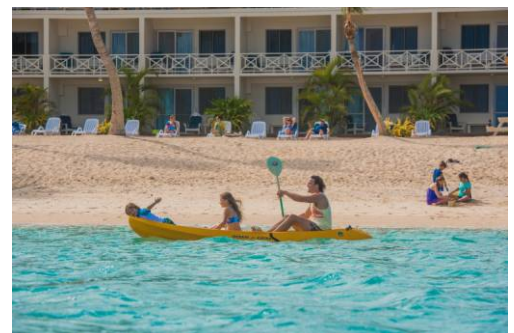
KAYAKS AVAILABLE FOR YOUR ENJOYMENT