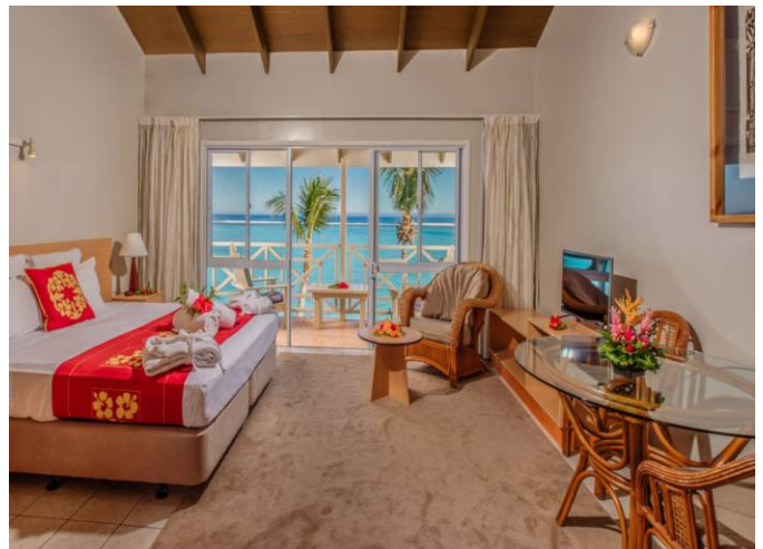
DELUXE BEACHFRONT STUDIO