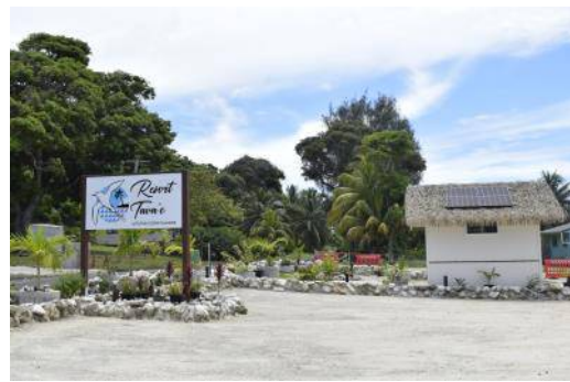
RESORT ENTRY & PARKING AREA

Return airport transfers and complimentary unlimited Wi-Fi.