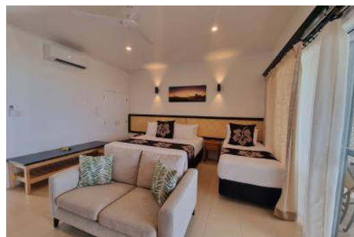
PREMIUM BEACHSIDE ROOM