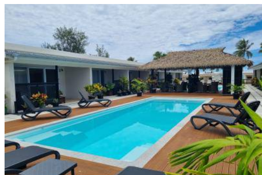
SWIMMING POOL & POOL CABANA